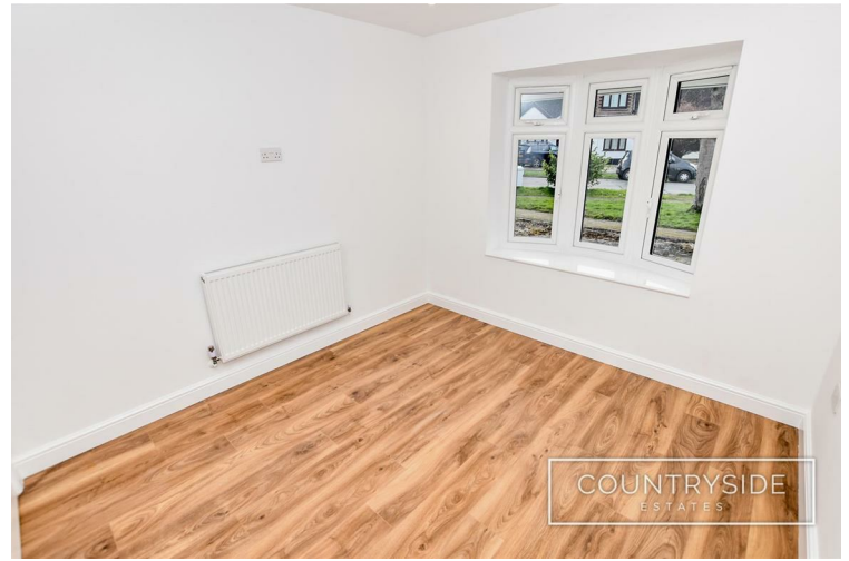
Window to front aspect, laminate flooring, smooth plastered ceiling, spotlights, radiator, power points.