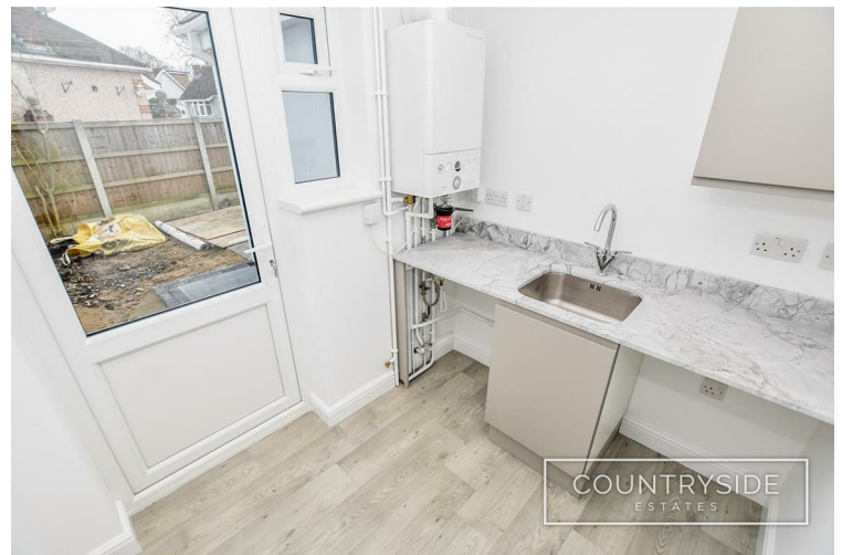
Half panelled door and window to side aspect, laminate flooring,