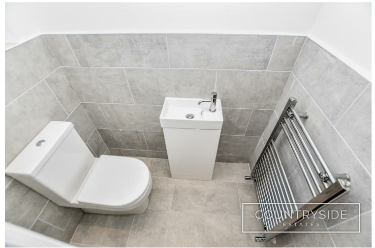
Obscure window to rear aspect, tiled flooring and half tiled walls, smooth plastered ceiling, spotlights, inset wash hand basin with chrome mixer tap, dual flush W.C, chrome heated towel rail, fuse box.