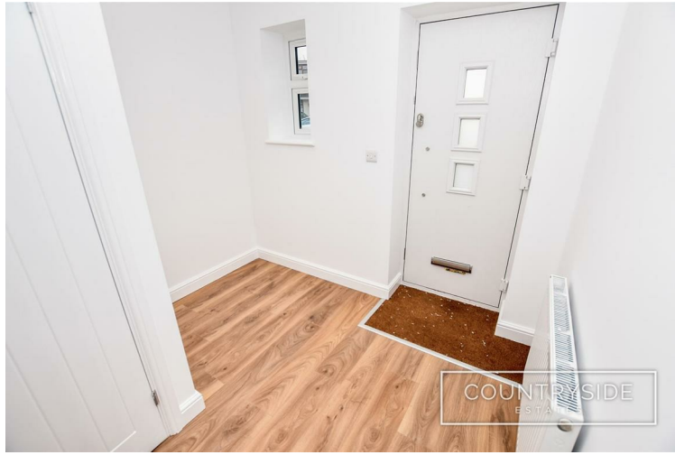
Composite front door, window to front aspect, laminate flooring, smooth plastered ceiling, spotlights, radiators and power points.