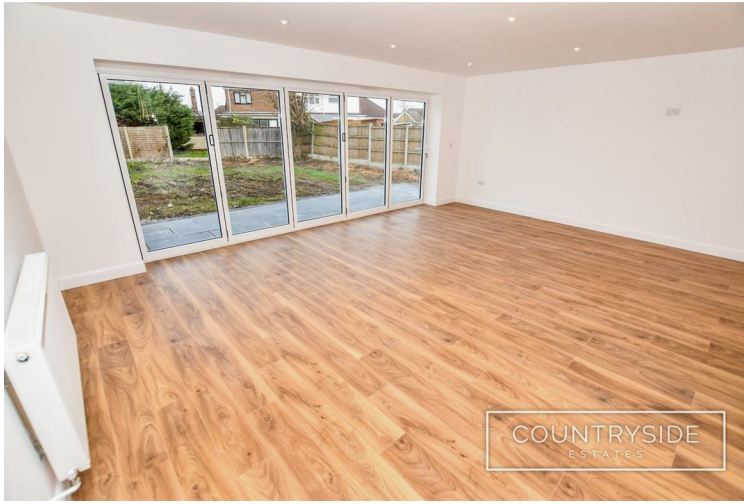
Reception Room Two / Bedroom Four 10'3" x 9'9" (3.12m x 2.97m)