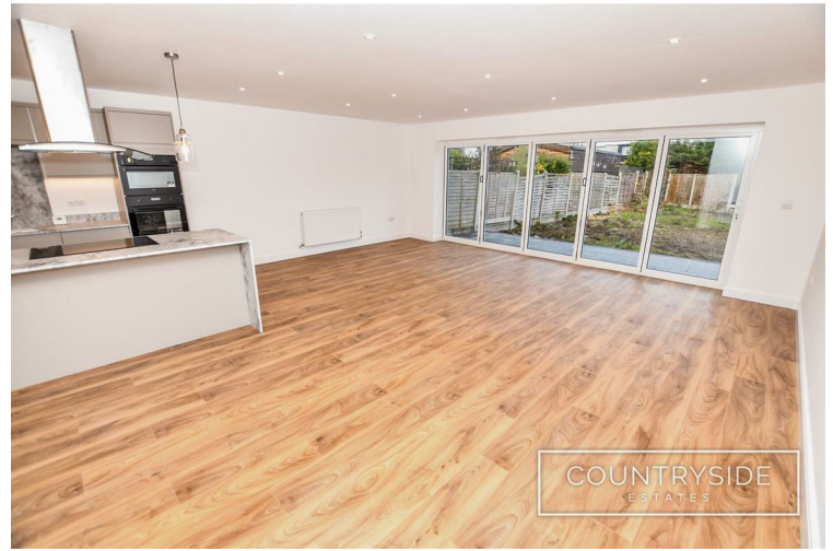
Bi-fold doors to rear aspect, laminate flooring, smooth plastered ceiling, spotlights, quartz worktops and splashback, waterfall island with AEG induction hob and extractor fan over. Handleless base and eye level units, 1 and a half ceramic sink with chrome mixer tap, AEG oven and combi microwave and grill, integrated dishwasher, fridge and freezer, radiators and power points.